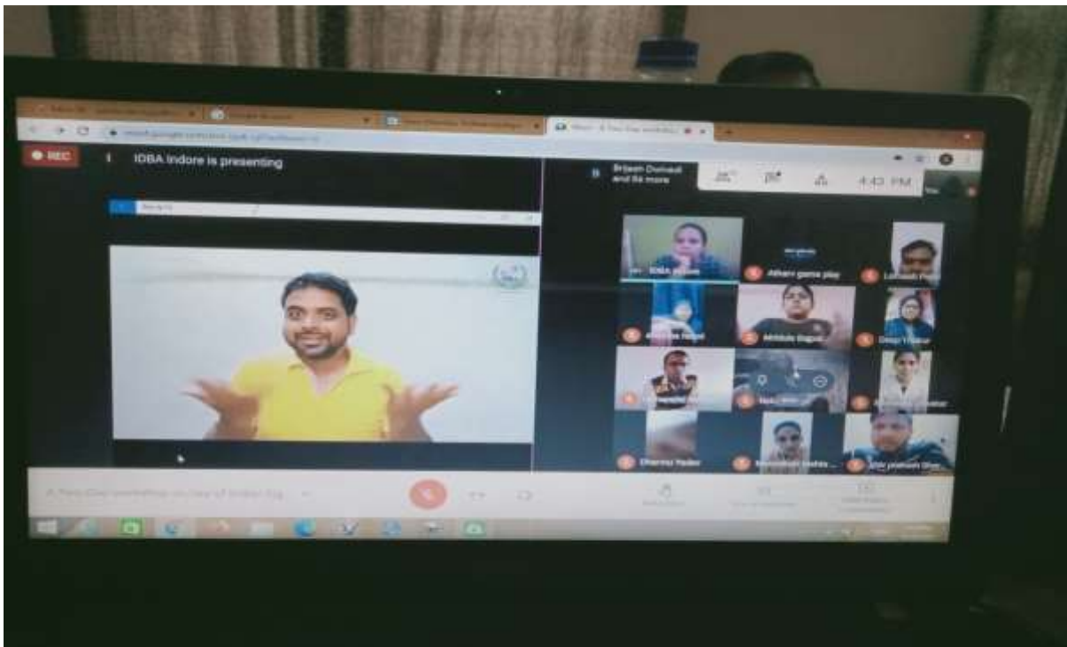
Image of Activities of the Workshop

Head Department of Education Guru Ghasidas Vishwavidyalaya Bilaspur (C.G.)