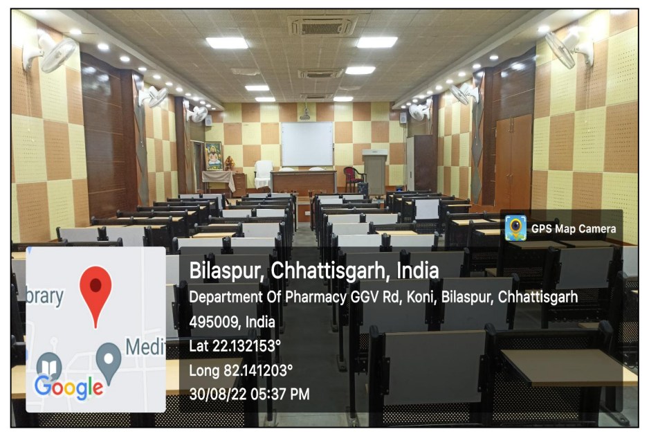
Semi Smart Class Room Number 04 of Department of Pharmacy