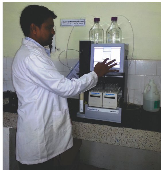
Recordings Being Taken of Chromatography Experiment