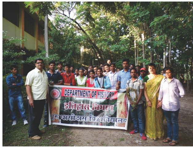
STUDENTS OF HISTORY IN A DRIVE FOR CLEANLINESS