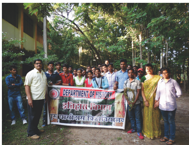
STUDENTS OF HISTORY IN A DRIVE FOR CLEANLINESS