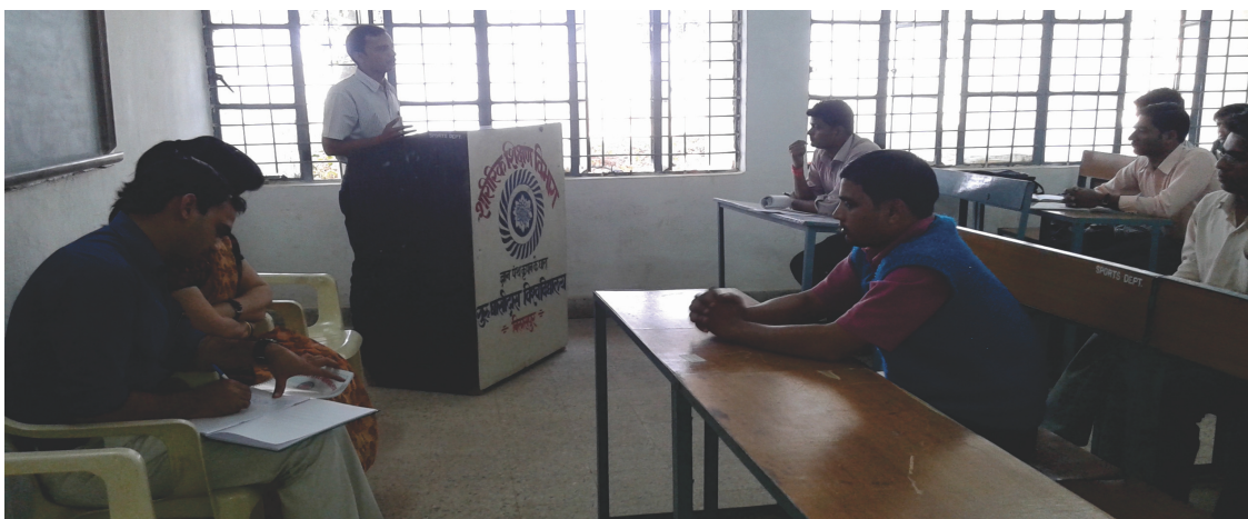
STUDENTS AND TEACHERS at AN INTERACTION PROGRAMME

The thrust areas of research and study in the department are regional study and developmental study with special reference to the History of Chhattisgarh. With the start of Pre-Ph.D. course work programme, the department is actively involved in the research and developmental studies to encourage academic interests in the field of History. In this regard, the department also organizes lectures by eminent historians and academicians of the field. On the occasions of various events related to the historical importance and dates associated with the great personalities, the department organizes seminars and discussions. Fellowships and scholarships provided by the state and central government are available to the students for research work. With the motive of all round development of the students and to generate community feeling amongst them the department also encourages the students towards active and successful participation in various extra- curricular activities as well as NSS.