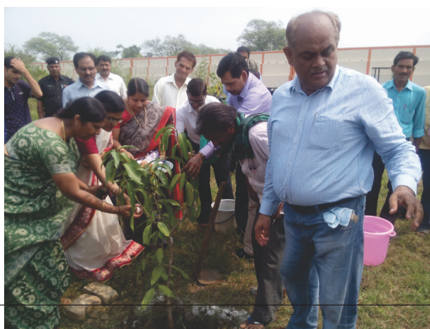
Teachers at a Plantation Campaign

the need for trained forestry man power in India. The Department is actively engaged in the development and management of the campus and hence massive scale plantation has been done using fast growing avenue trees and ornamental species to