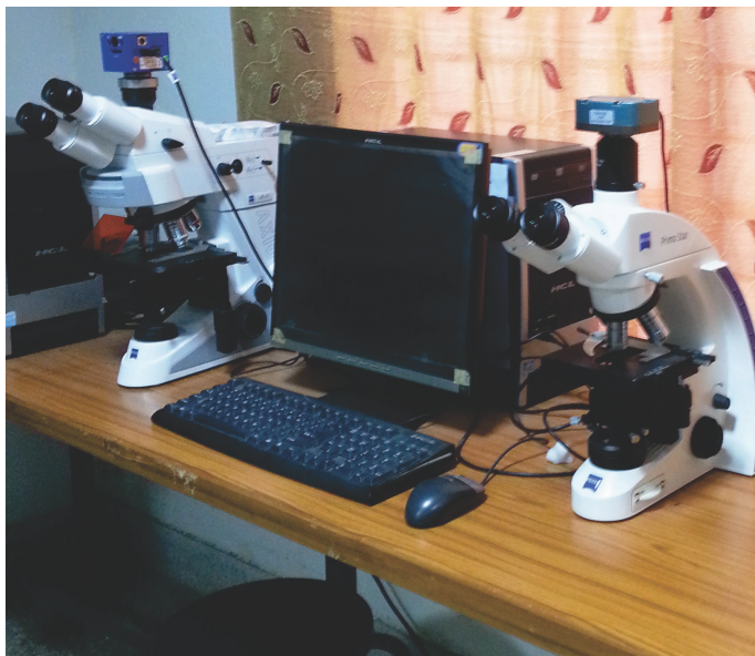
Lab Equipped with High-end Microscopes