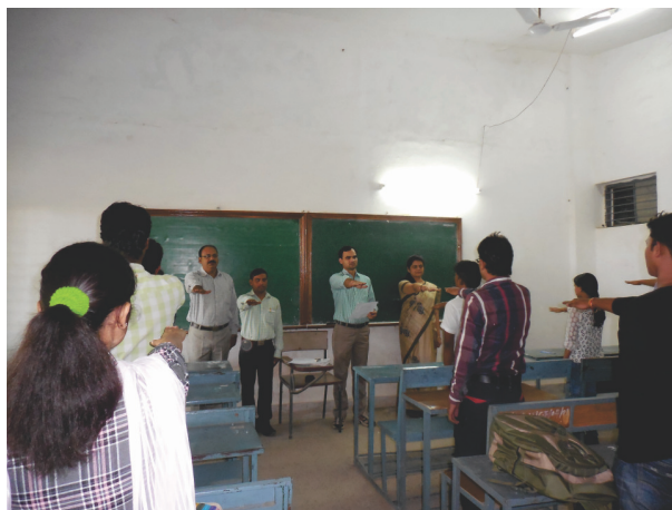
STUDENTS TAKING PLEDGE FOR CLEANLINESS