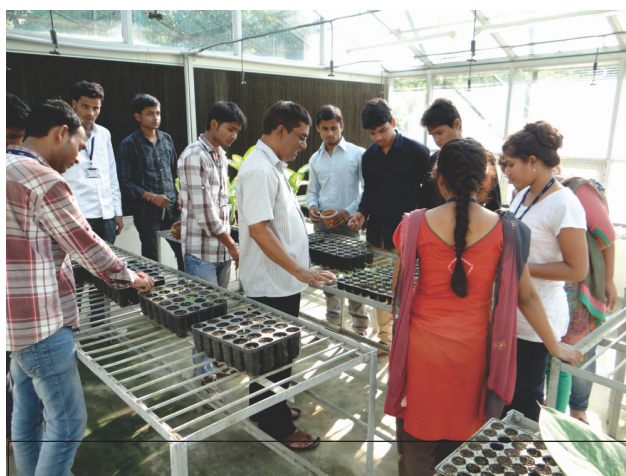
Students Being Guided at a Glass House Nursery

The Department of Forestry, Wildlife & Environmental Sciences was established in the year 1989. Since its inception it is dedicated for promoting excellence in education to develop the students with innovative knowledge and skill and to cater to