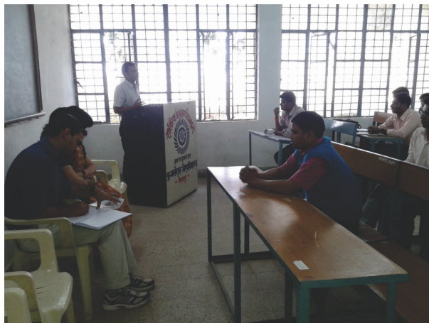
STUDENTS AND TEACHERS at AN INTERACTION PROGRAMME

The Department takes all steps for suitable placement of students through regular interaction with the industry. The following organizations selected students for their final placements through campus interview: 4 students were selected in MHFC, Mumbai; another 4 were selected in ADCC Infotech Ltd. Nagpur and one of the students secured Gandhi Fellowship,