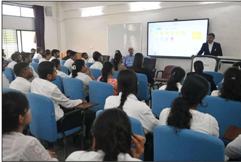
Students attending Advocacy Lecture via PPT being displayed on Digital Smart Board