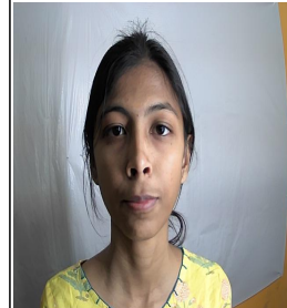
Test Day Photo