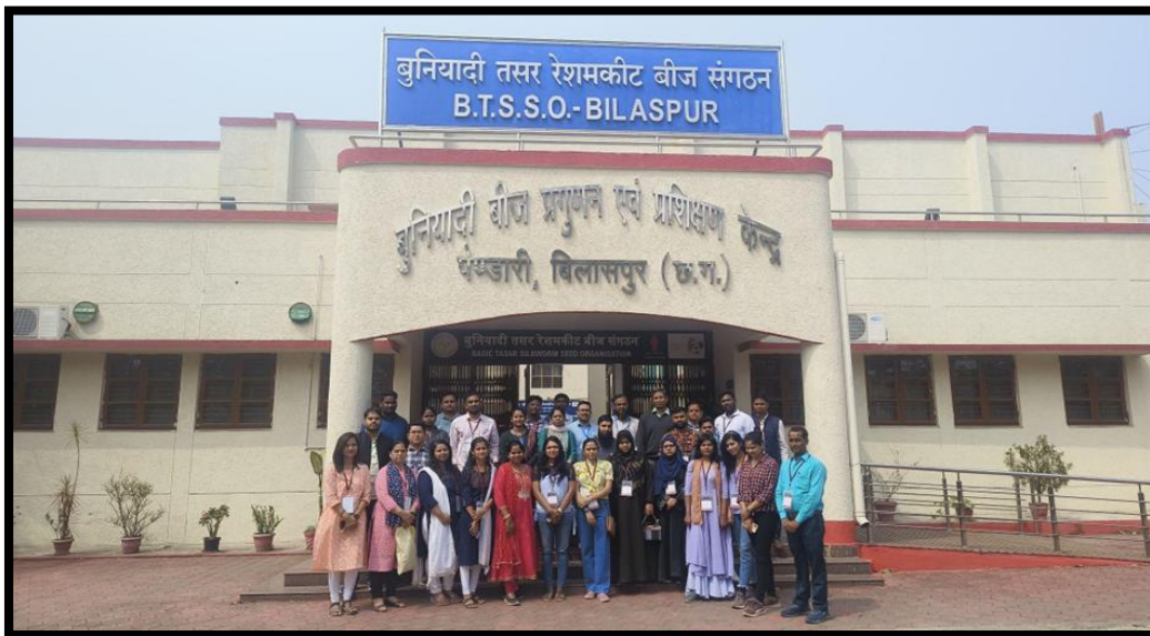
Field Visit of Participants