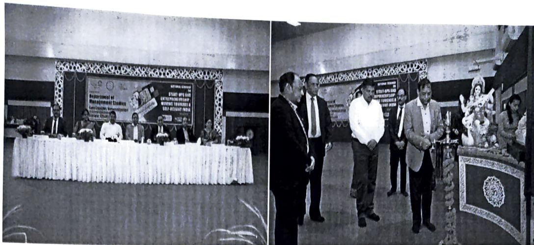
Dignitaries on the dias lighting lamp.