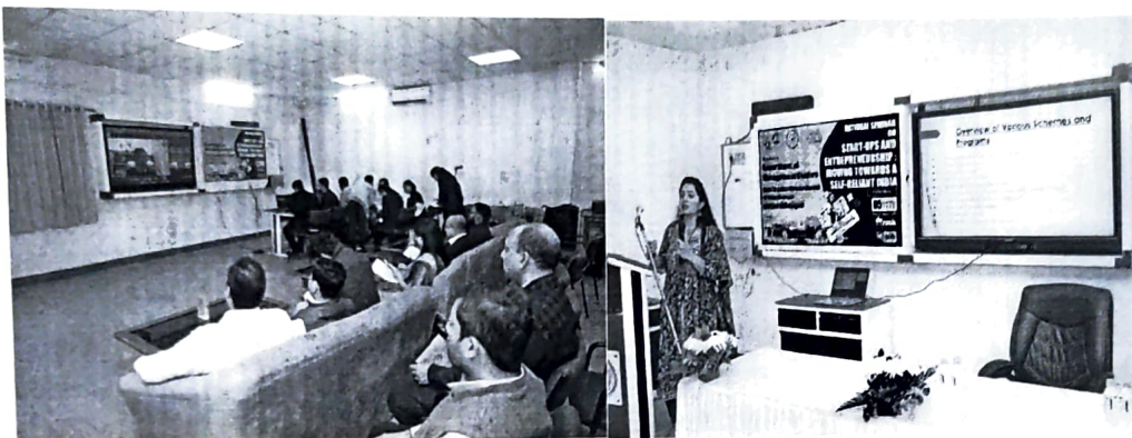
Online and Offline Research Paper Presentation.