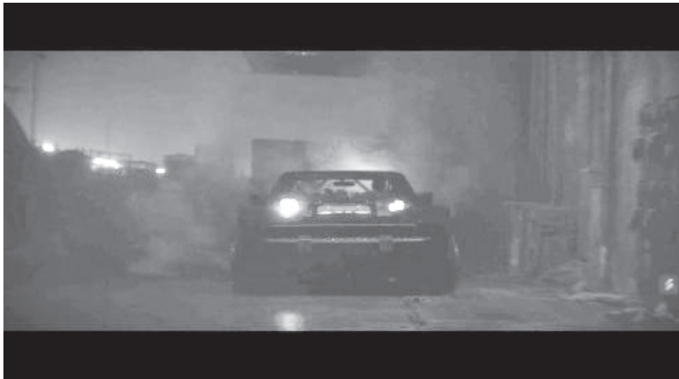
Figure-9: Batmobile in Technocolours

At around 01:57:56 hours, the Catwoman appears again in a cybergoth look wearing light pink hair with a black leather corset inside her full-length leather pants which shine out from