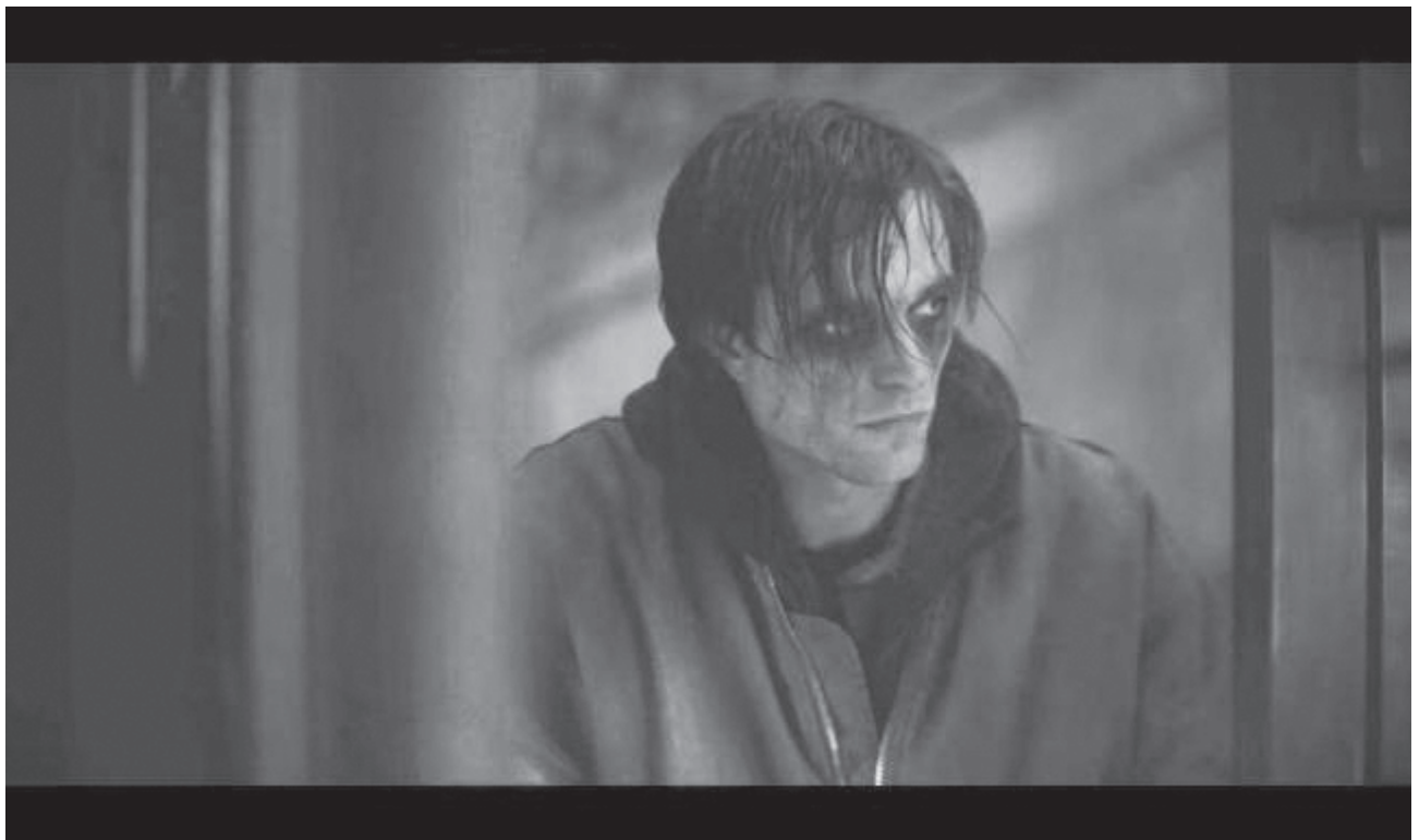
Figure-7: Bruce Wayne in Vamp Goth

When the interior of the Wayne House is revealed at 23:23 minutes, one can see how truly