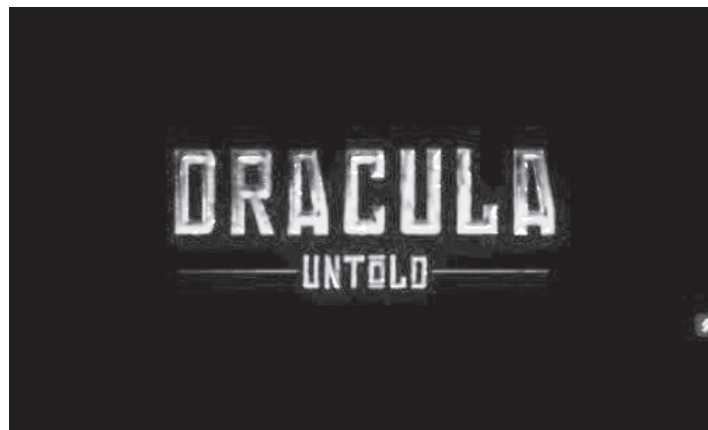
Figure-6: Dracula Untold logo in the fire

with the impressions of bats flying inside the logo while the logo is in fire, both of which you can see in the figures-5 and 6.