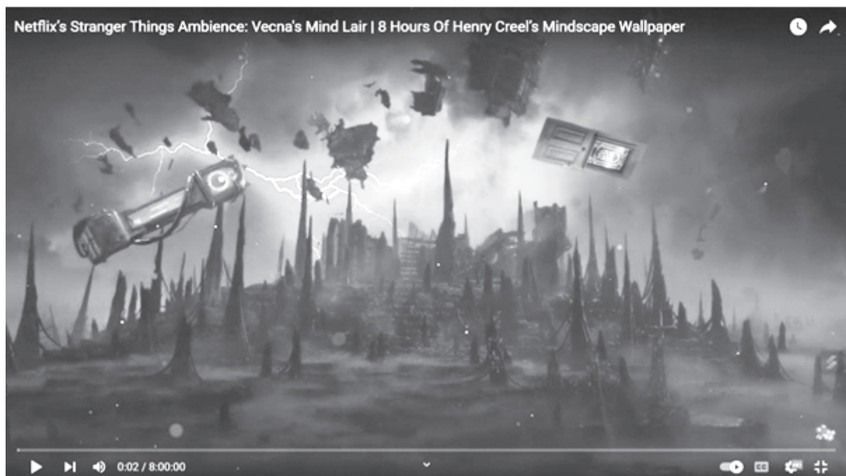
Figure-1: Vecna's Castle in Gothic Setting

always be Horror. Later in history, when Goth Rock was presented by bands like the Bauhaus (1978–2008) and its famous song 'Bela Lugosi's Dead' which came in the year 1979, Alien Sex Fiend (since 1982), and The Cult (since 1983), it transitioned from architecture and literature to songs with a mixture of heavy rock and synth-pop like one can see it in the fourth season of 'Stranger Things' (since 2016) which came out in 2022 created by 'Duffer Brothers' where the character of Eddie Munson played by Joseph Quinn goes in another world named as the 'Upside Down' and starts playing rock guitar to give his friends cover from the evil bat-like flying creatures and some time to accomplish the immediate target to kill the Antagonist Creature 'Vecna.' The main theme of that show is properly made on synth music and the scene where Eddie Munson dies playing a heavy metal rock song is purely Gothic with details of Eddie's Punk Gothic outfit, makeup, Goth rock, the dark clouds thundering in dark red lights while bat-like small creatures fly through the whole sky and Vecna's castle also known as his Mindlair inspired by