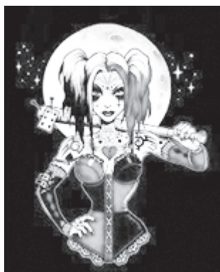
Figure-4: Harley Queen in Goth Lolita

Goth, however, has come a very long way from being a Germanic Tribe to a Subculture and has thus covered a great deal of ground, but when it entered the mainstream, although it is not restricted to certain boundaries, it only managed to cover a few things. For instance, in the 1999 film The Matrix , Keanu Reeves' character Neo is dressed in cybergoth fashion, which makes sense in the context of the story but does not fully represent the history of Gothic. It will need a great deal of attention to detail in everything from architecture to make-up to symbols to colours to clothing to music to reflect the entire Gothic situation.