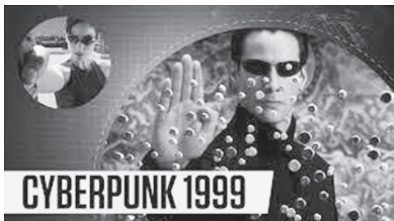
Figure-3: Neo in Cybergoth