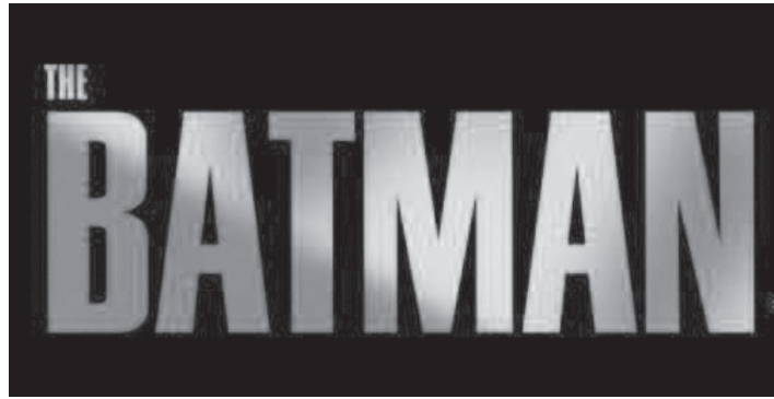
Figure-5: The Batman logo with a bat silhouette