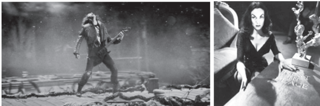
Figure-2: Eddie Munson in Punk Gothic, Figure-2: Maila Nurmi in Trad Goth

Lolita (Harley Queen) which are in the figures - 1, 2, 3, and 4 and other gothic looks. But, there were some things which can be said to restrict or bind the fashion sense as it fixed the gender-constructed meaning like only women wear corsets or only men have short haircuts. Although traditionally a part of women's clothing, corsets are worn by women to conceal their abdominal fat from onlookers because, in British civilization, class and representation were the most important factors at the time. Men wore waistcoats for the same reason, but as cross-fashion began, where women began wearing men's clothing, men also began wearing corsets. Today, corsets are becoming more popular in men's fashion, much like boys' haircuts in women's are. Yet, after a while, males began wearing corsets, and Gothic fashion became genderless.