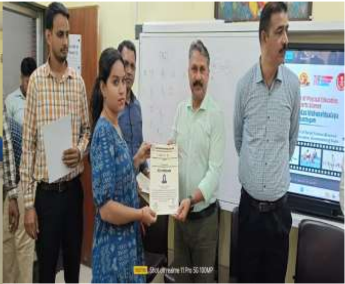
Distribution of Certificates to RMC Participants after completion of the Course