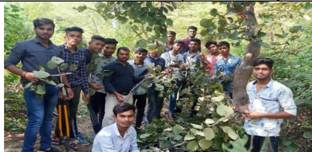
Lac cultivation and production activity