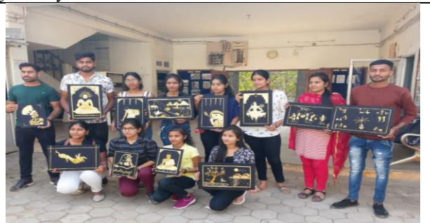
Paira (paddy straw) art making activity