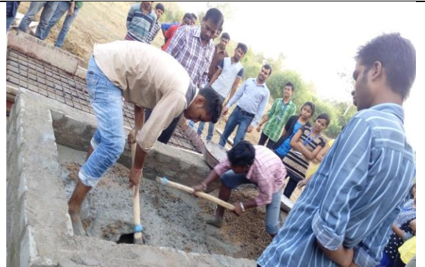
Learning of construction activity