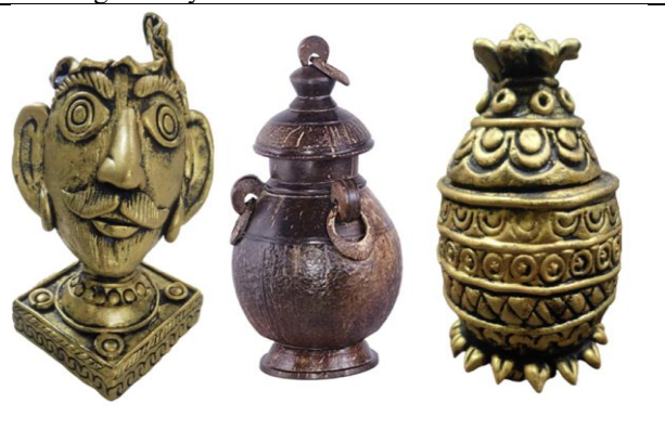
Coconut shell art making activity