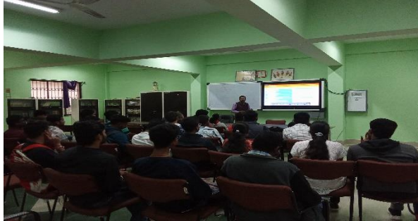
Teachers use ICT enabled tools including online resources for effective teaching and learning processes at Department of Rural Technology & Social Development, G.G.V.