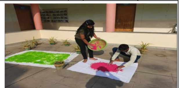
Herbal gulal production activity