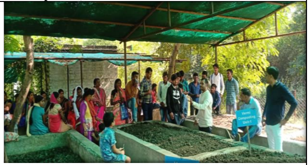
Vermicompost production activity