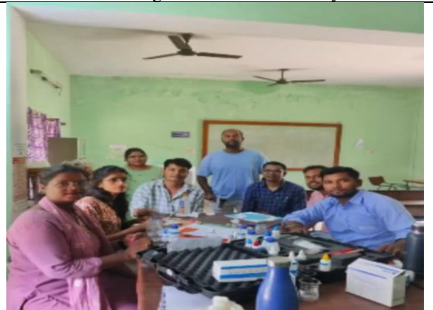
Learning of water quality assessment