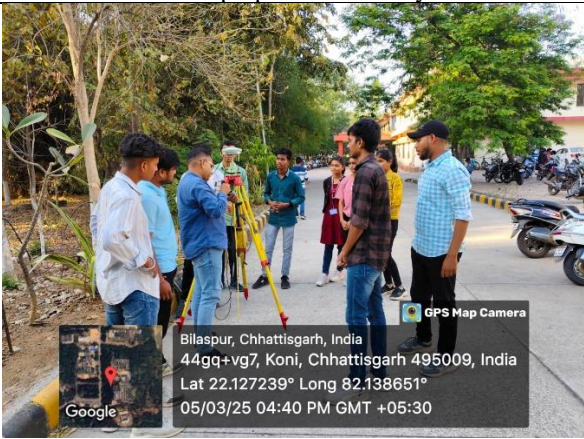
Learning of remote sensing techniques