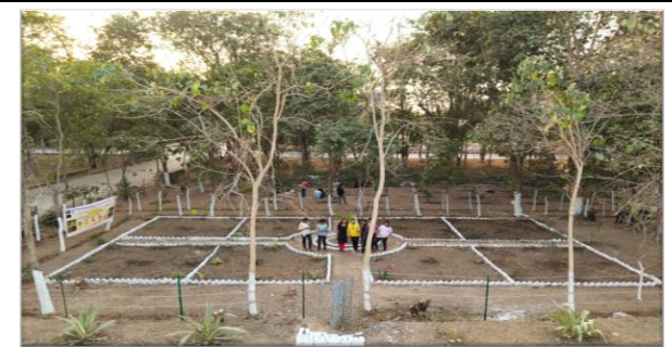
Nursery management activity