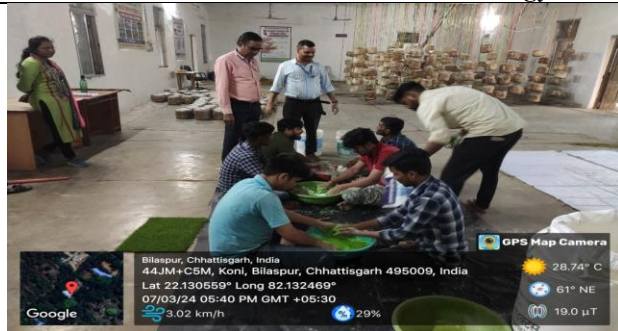
Mushroom cultivation and production activity

Conduction of experiential, participative learning and problem-solving methodologies by Department of Rural Technology & Social Development, G.G.V.