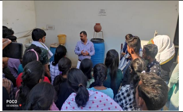
vermiwash production activity