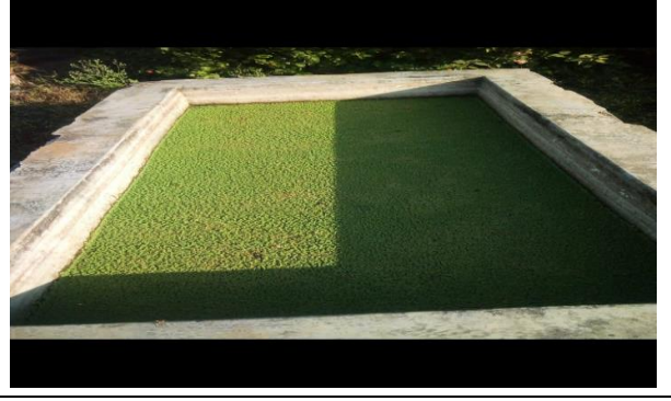
Azolla production activity