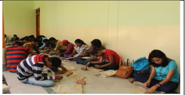
Making wooden art activity